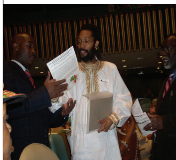
Brother Che at the African Union, Afrikan Celebrations