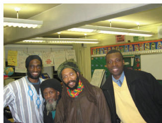
Figure 3 Kings of the School – Afrikan Unity of Harlem Men discuss Empowering Black Community