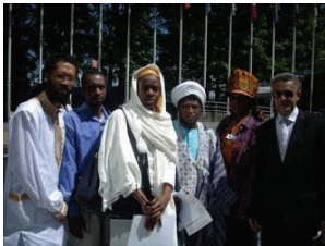
Figure 2 Afrikan Unity of Harlem Leadership